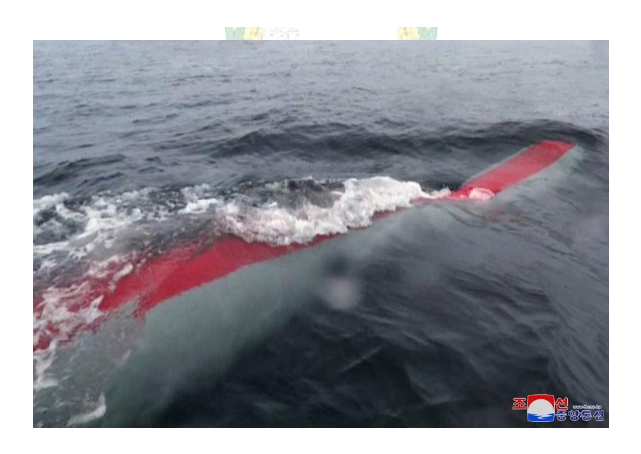
Underwater Strategic Weapon System Test Held